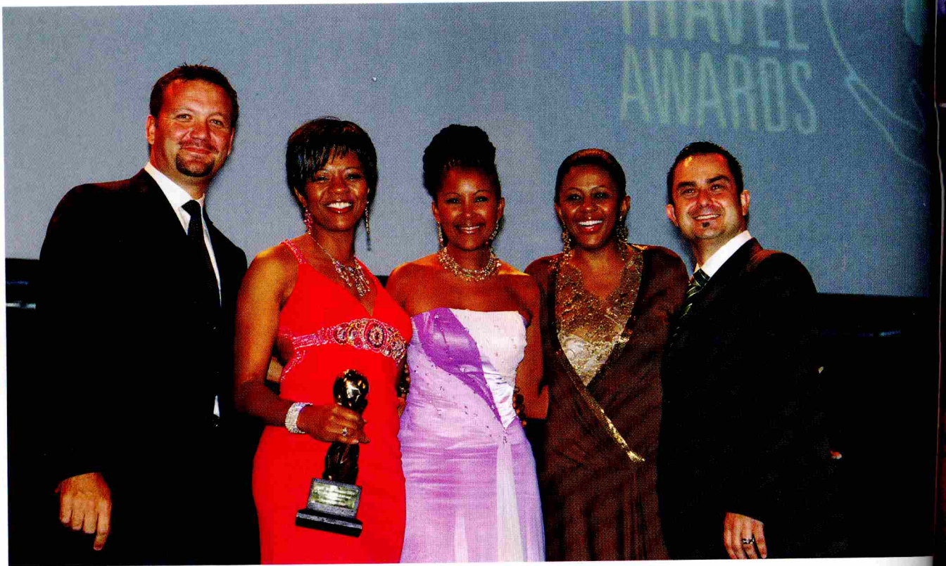
Category winners at the World Travel Awards.

The INDABA event is our annual coming-out party, where those in the industry bring out the best of what our country has to offer, and display it openly and invitingly.